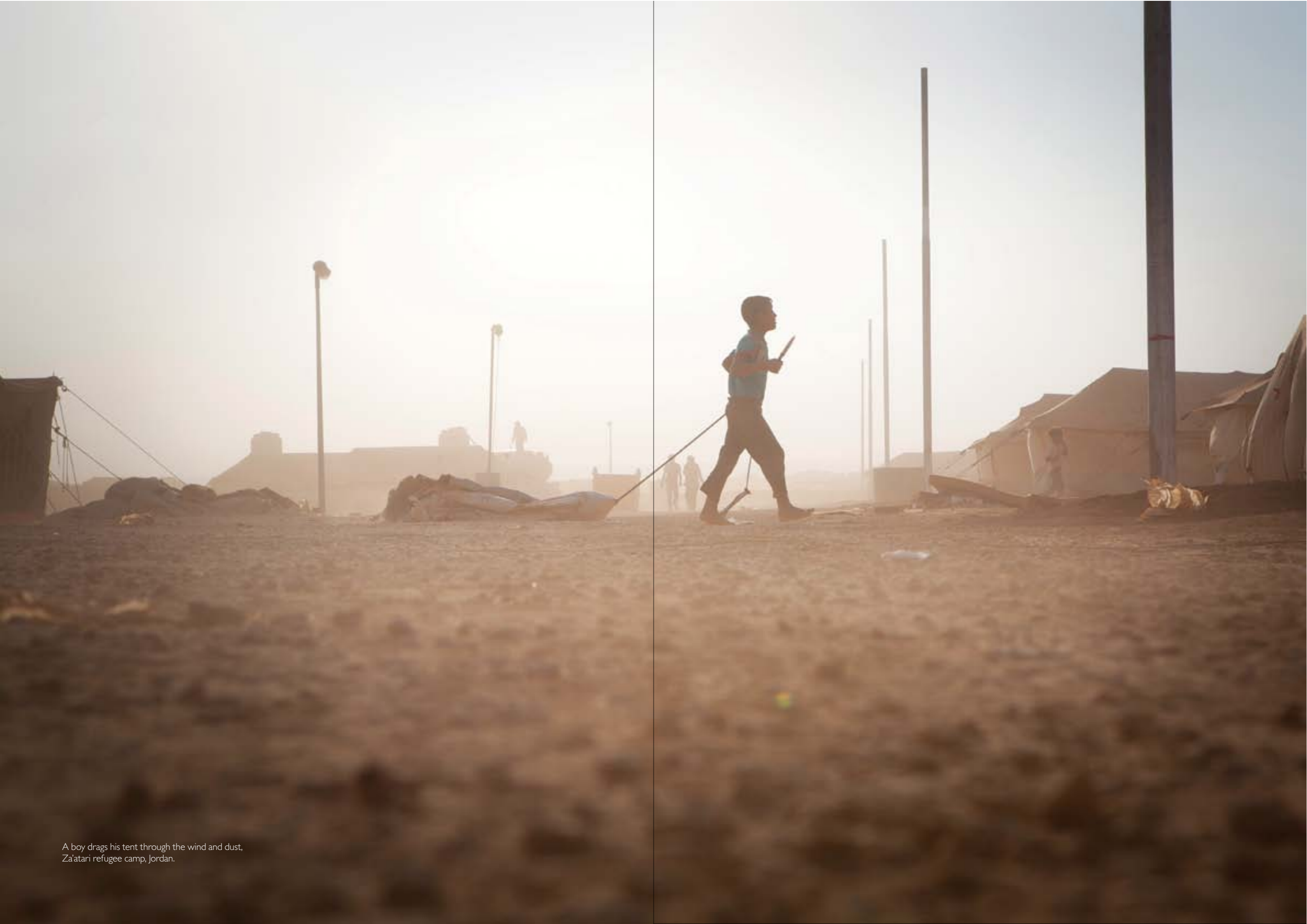
A boy drags his tent through the wind and dust, Za'atari refugee camp, Jordan.