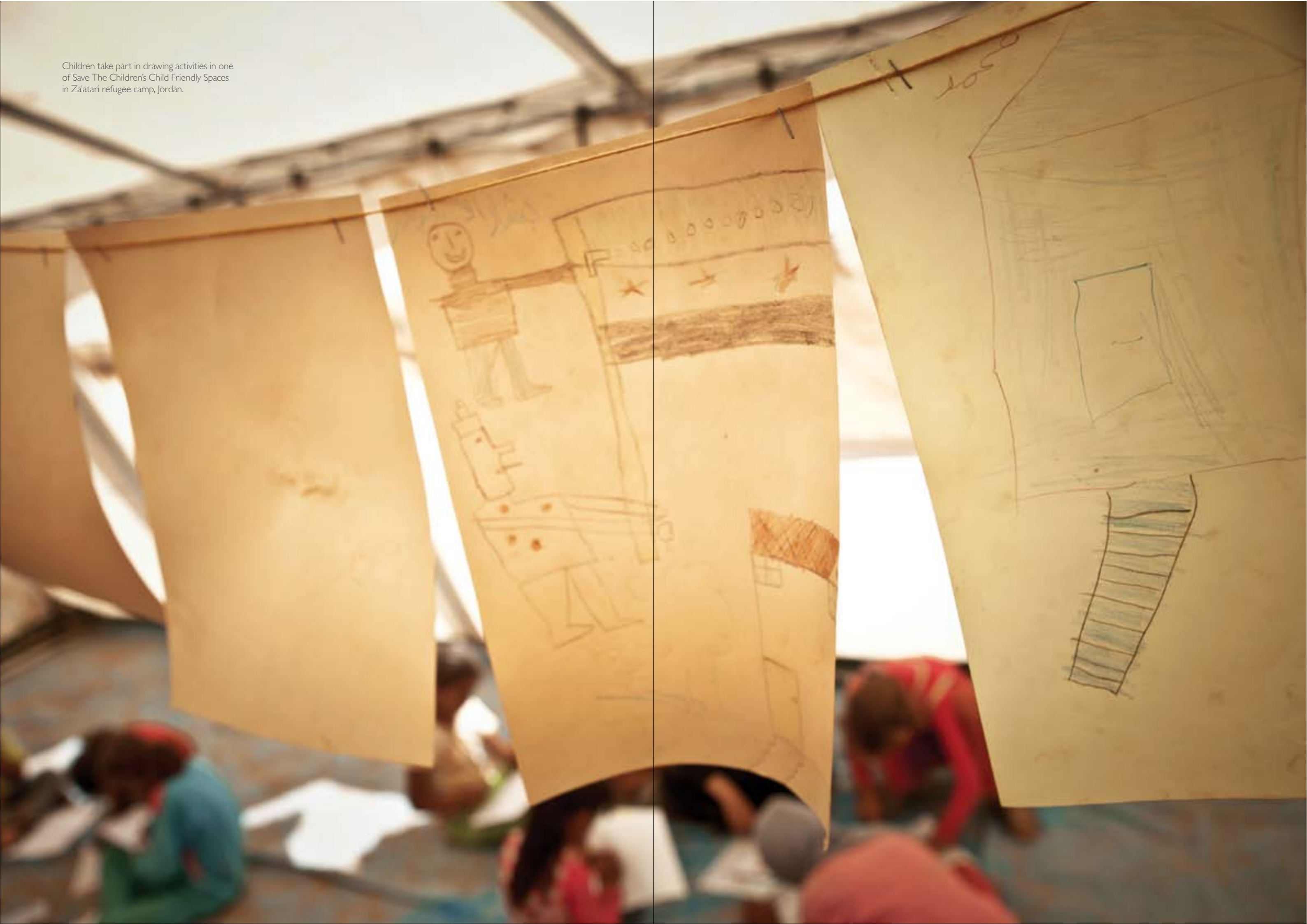
Children take part in drawing activities in one of Save The Children's Child Friendly Spaces in Za'atari refugee camp, Jordan.