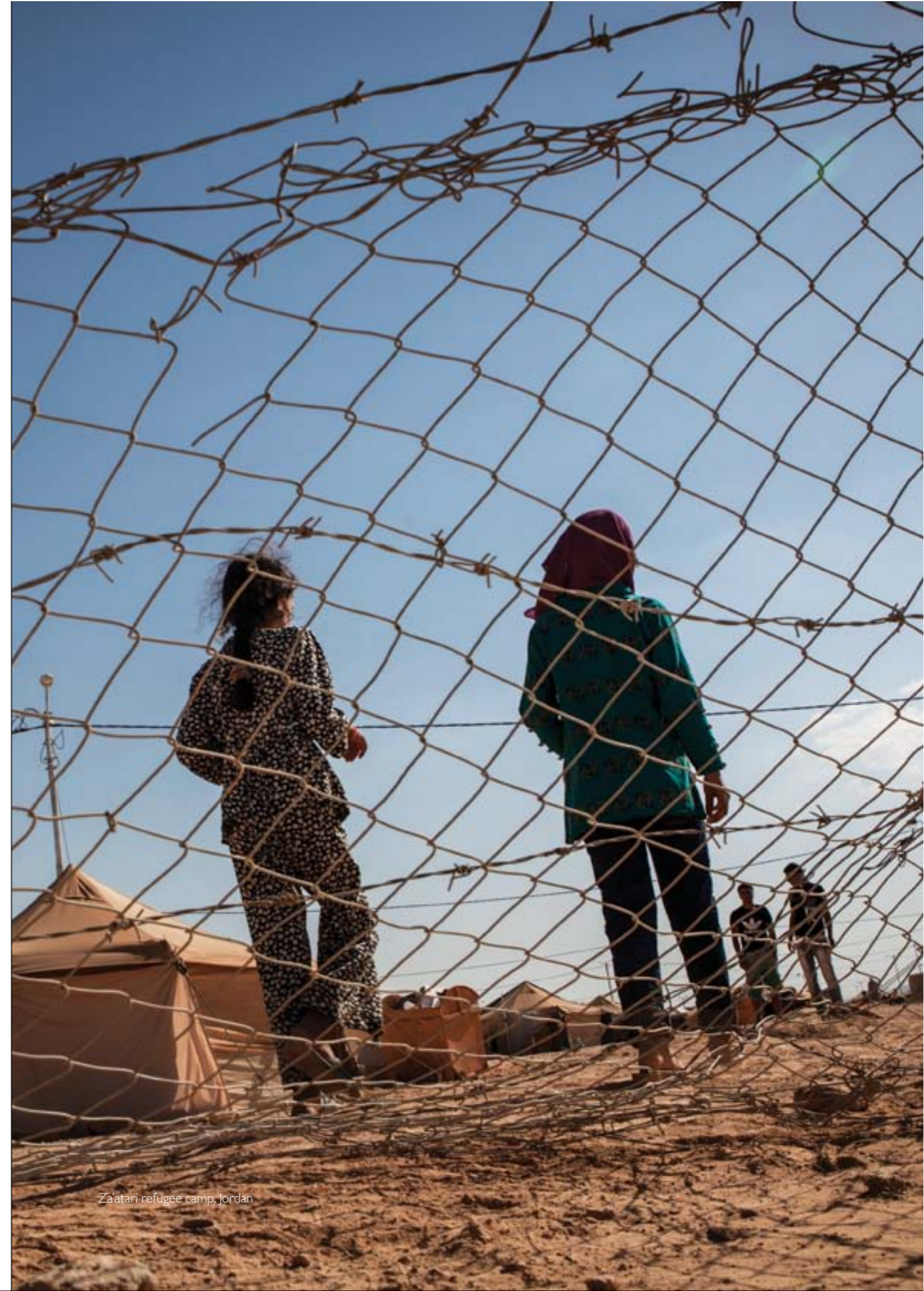
Zaatari refugee camp, Jordan