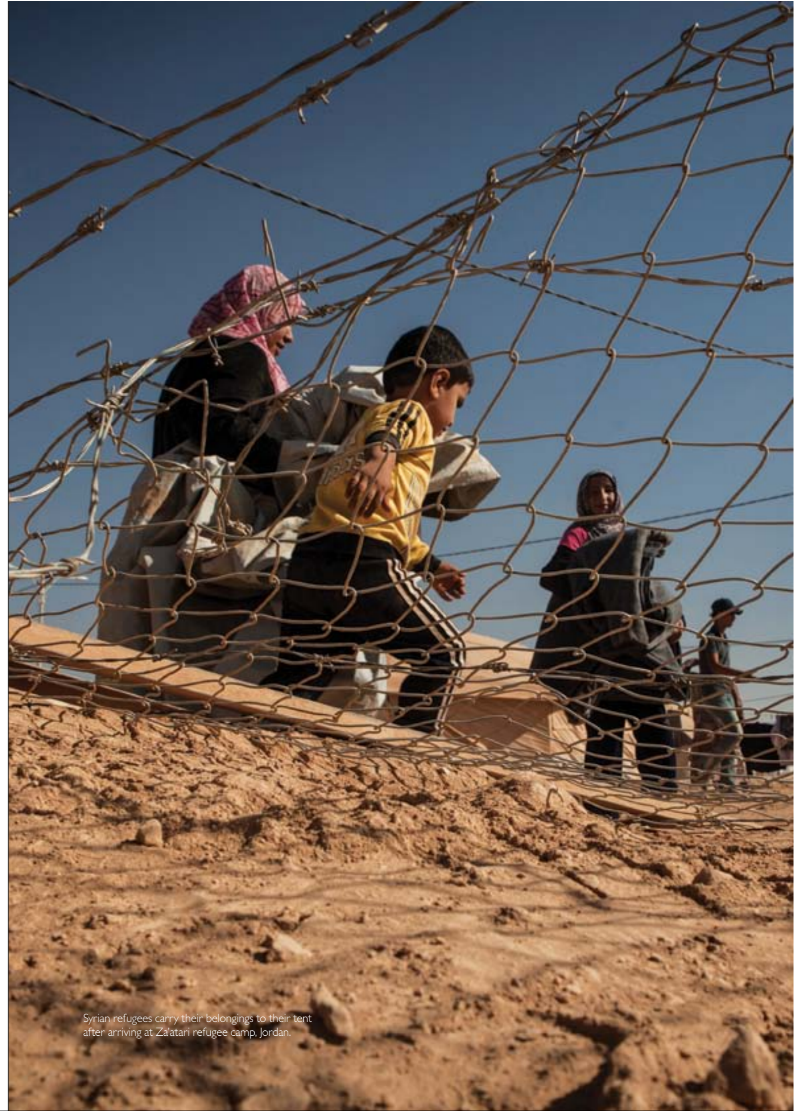
Syrian refugees carry their belongings to their tent after arriving at Za'atari refugee camp, Jordan.

Now, in my sleep, my friends tell me that I shout for my mother and sometimes scream “Leave me alone! Leave me alone!”