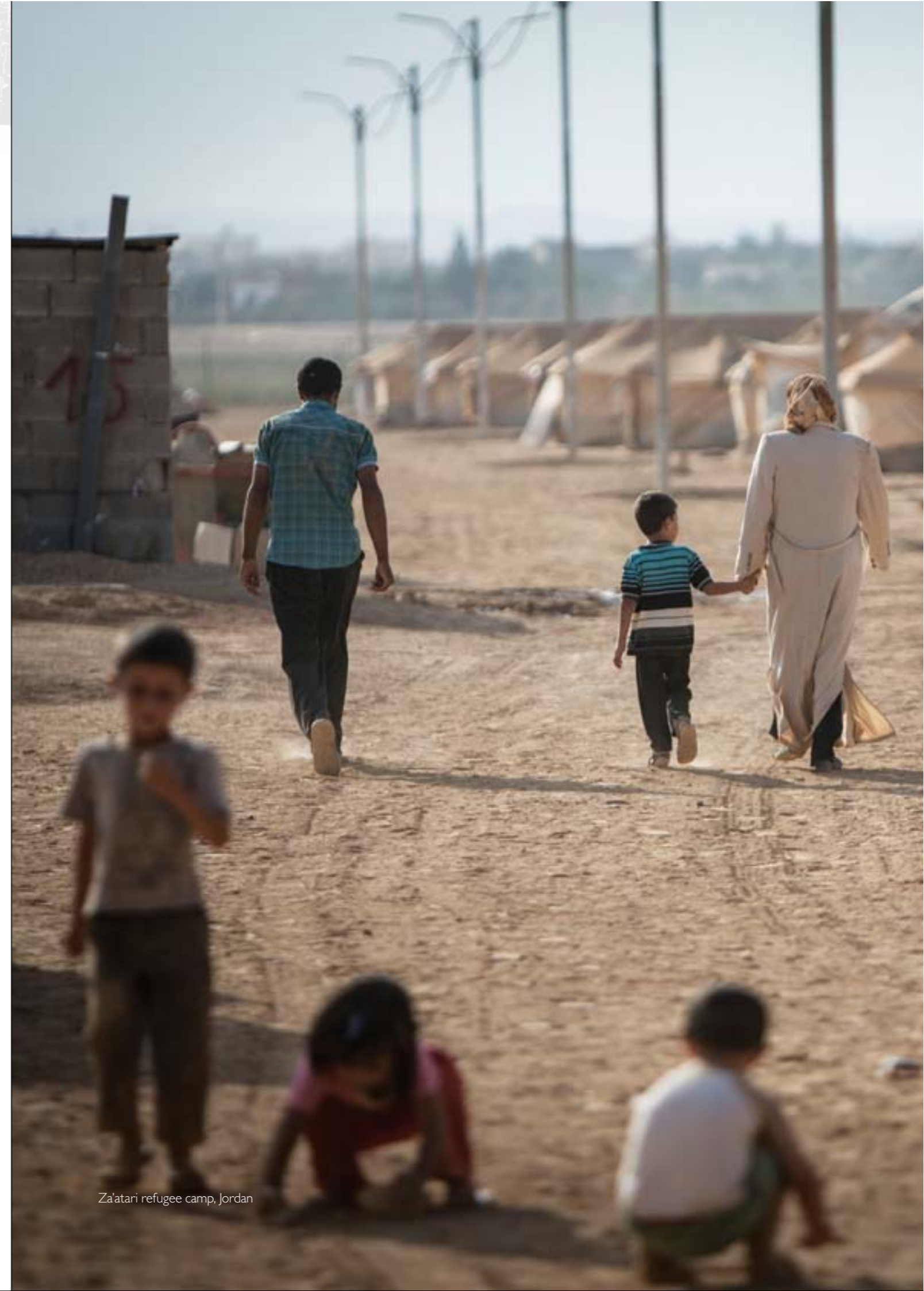
Za'atari refugee camp, Jordan

I thought that surely, after this, there would be no more shelling. I was wrong – there were more shells, more rockets, and then some shooting. At the beginning of the massacre there were no snipers, but then they came in. It was then that we realised we couldn’t bury everyone separately, it was too dangerous. So we decided on a mass grave for the 220 bodies.